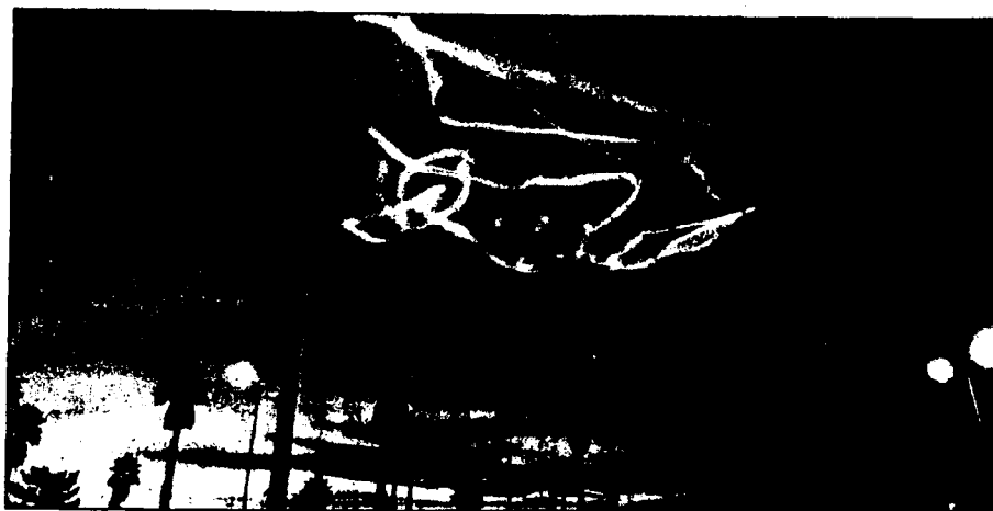
A contrail is left by a rocket, carrying an SDI satellite, that was launched from Vandenberg Air Force Base.

10-NEWS / SUNDAY, NOVEMBER 22, 1992 / DAILY NEWS