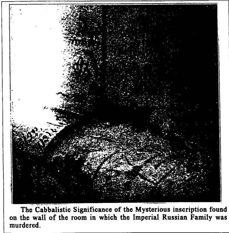
The Cabbalistic Significance of the Mysterious inscription found on the wall of the room in which the Imperial Russian Family was murdered.