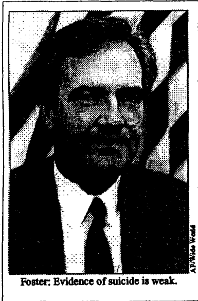
Foster: Evidence of suicide is weak.