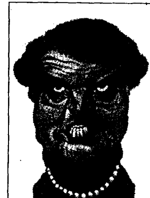
H: Make sure Ms. Albright's picture is affixed; you know, that Secretary of State, U.S.A. who "didn't know she was Jewish".

Make sure Ms. Albright's picture is affixed; you know, that Secretary of State, U.S.A. who "didn't know she was Jewish".