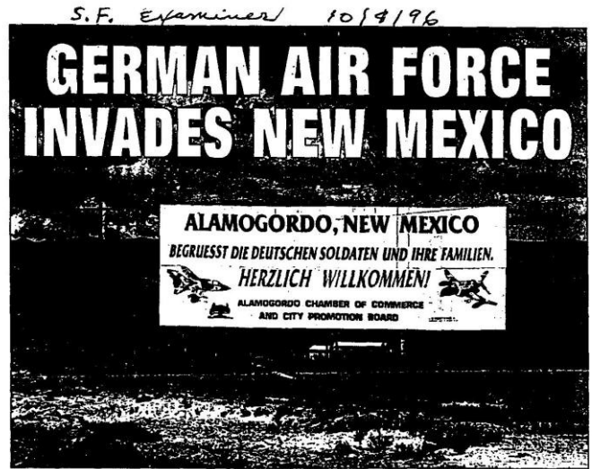
he Germans are paying millions of dollars for the base in Alamogordo that has WWII vets fuming