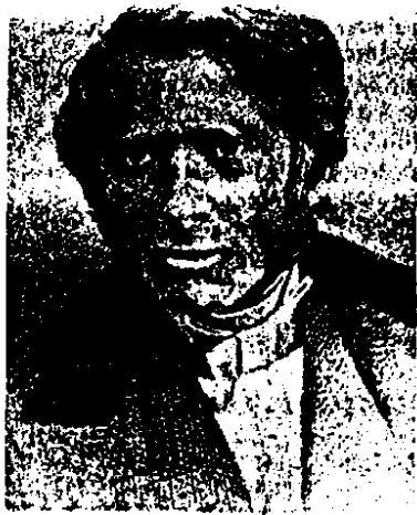
John Ruskin