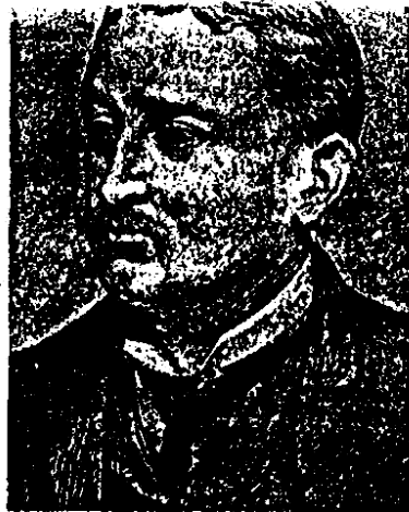
Cecil Rhodes