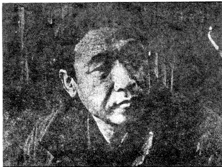
Drug Lord Khun Sa offered to cut off heroin to the United States. His offer was refused.

intercepted, according to the government, about 1,000 pounds of that.