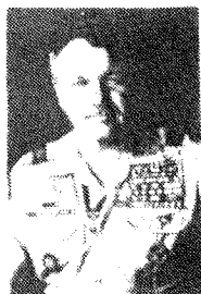
COL. JAMES "BO" GRITZ PALO ALTO, CA. 7/91 $20.00...2 Hour...Video Tape

To Order Call: America West 1800-729-4131