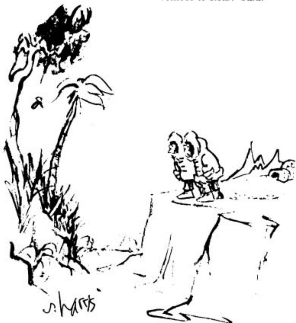
"I thought continental drift was much slower."