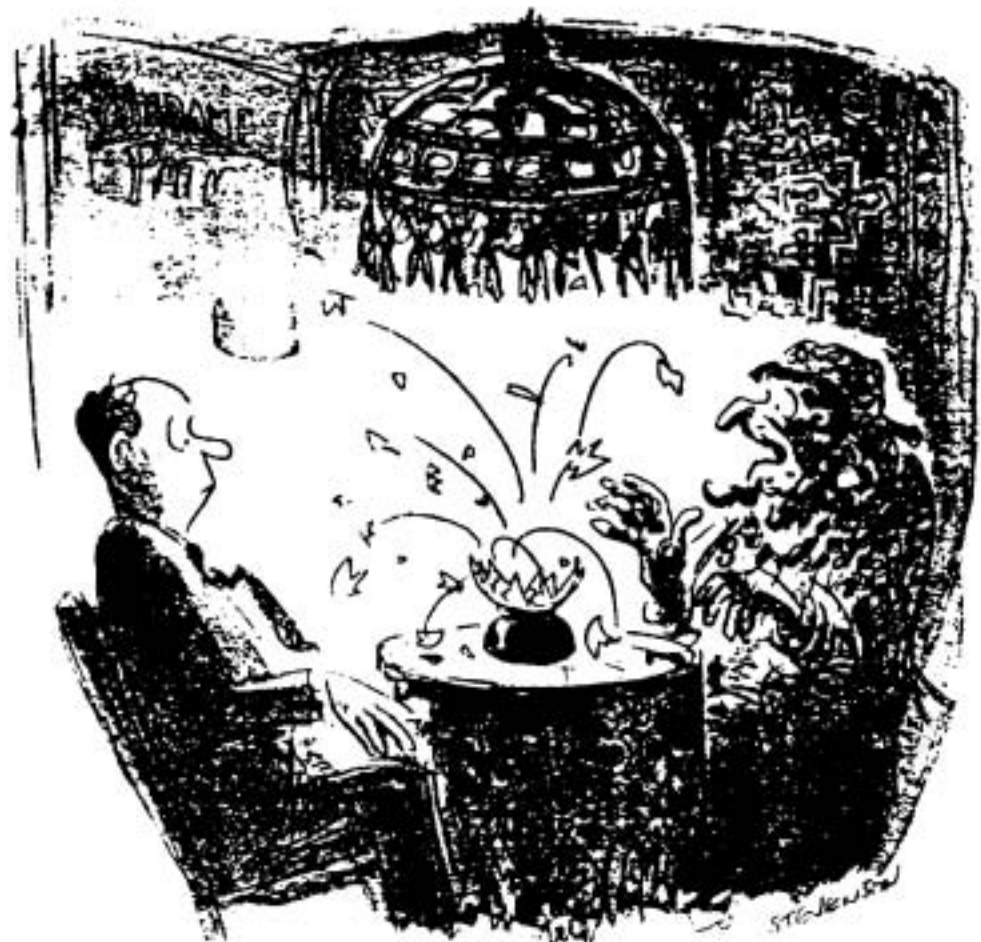
"This is a first!"