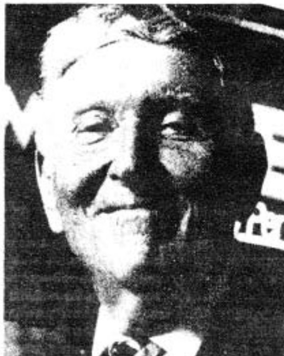
Media Boss Sumner Redstone: Television

In only 54 cities in America are there more than one daily newspaper, and competition is frequently nominal even among them, as between morning and afternoon editions under the same ownership. Examples of this are the Huntsville, Alabama, morning News and afternoon Times ; the Birmingham, Alabama, morning Post Herald and afternoon News ; the Mobile, Alabama, morning Register and afternoon Press ; the Springfield, Massachusetts, morning Union , afternoon News , and Sunday-only Republican ; the Syracuse, New York, morning Post-Standard and afternoon Herald-Journal —all owned