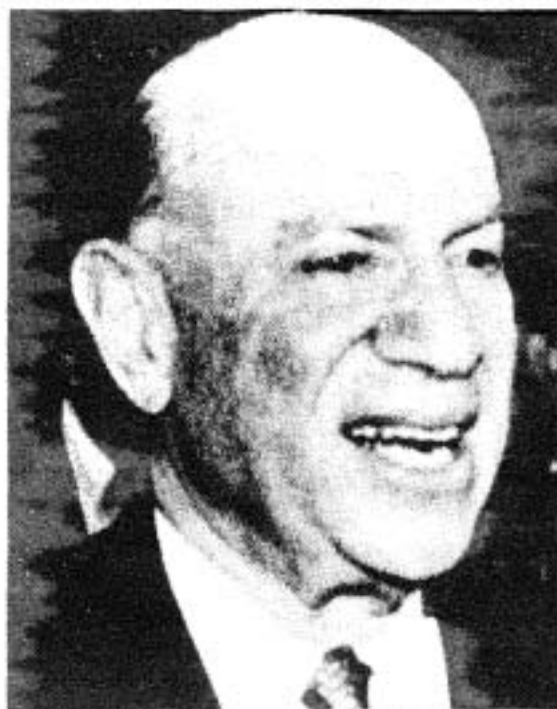
Media Boss Laurence Tisch: Television

CBS was under the domination of William S. Paley for more than half a century. The son of immigrant Jews from Russia, Paley left the family cigar business in 1928, when he was 27, to buy United Independent Broadcasters for $500,000. He renamed it Columbia Broadcasting System and made himself president. He became chairman of the board in 1946 and held that post until his partial retirement in 1983.