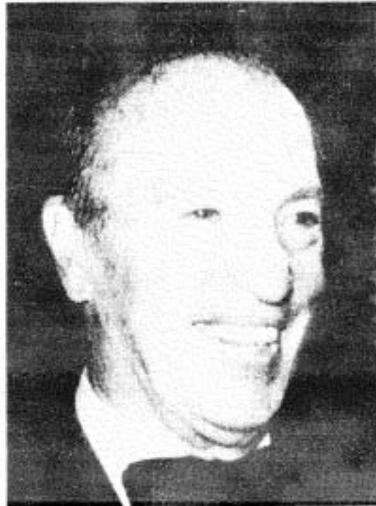
Media Boss Leonard Goldenson: Television

The control of the opinion-molding media is monolithic. All of the controlled media—television, radio, newspapers, magazines, books, motion pictures—speak with a single voice,