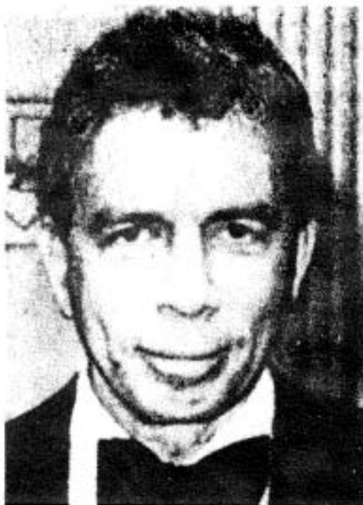
Media Boss Samuel Newhouse: Newspapers, books, magazines

New York's other major newspapers are in no better hands than the New York Times and the Wall Street Journal . The New York Post is owned (at least tentatively, pending the outcome of an investigation by the Securities and Exchange Commission) by Jewish bill collector Steven Hoffenberg, whose Towers Financial Corporation ($700 million in assets) provided the