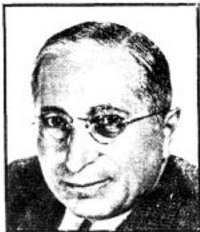
LOUIS B. MAYER