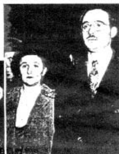
JULIUS and ETHEL ROSENBERG