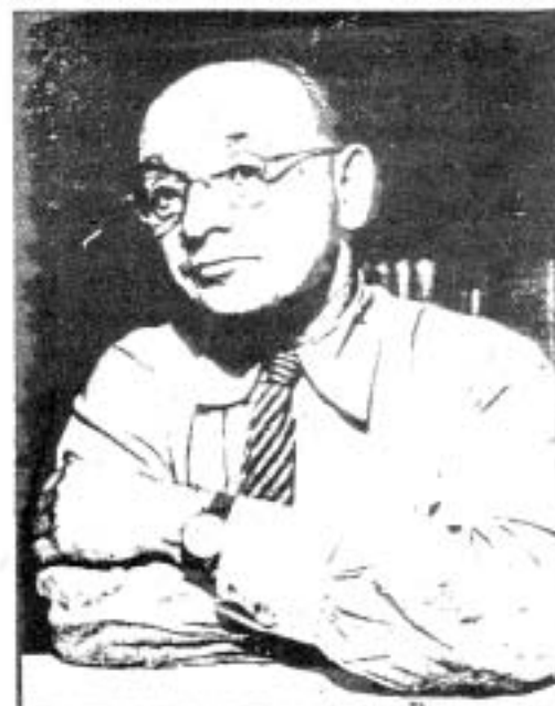
GERHART EISLER, highest ranking communist ever convicted in the U.S. He's Jewish.