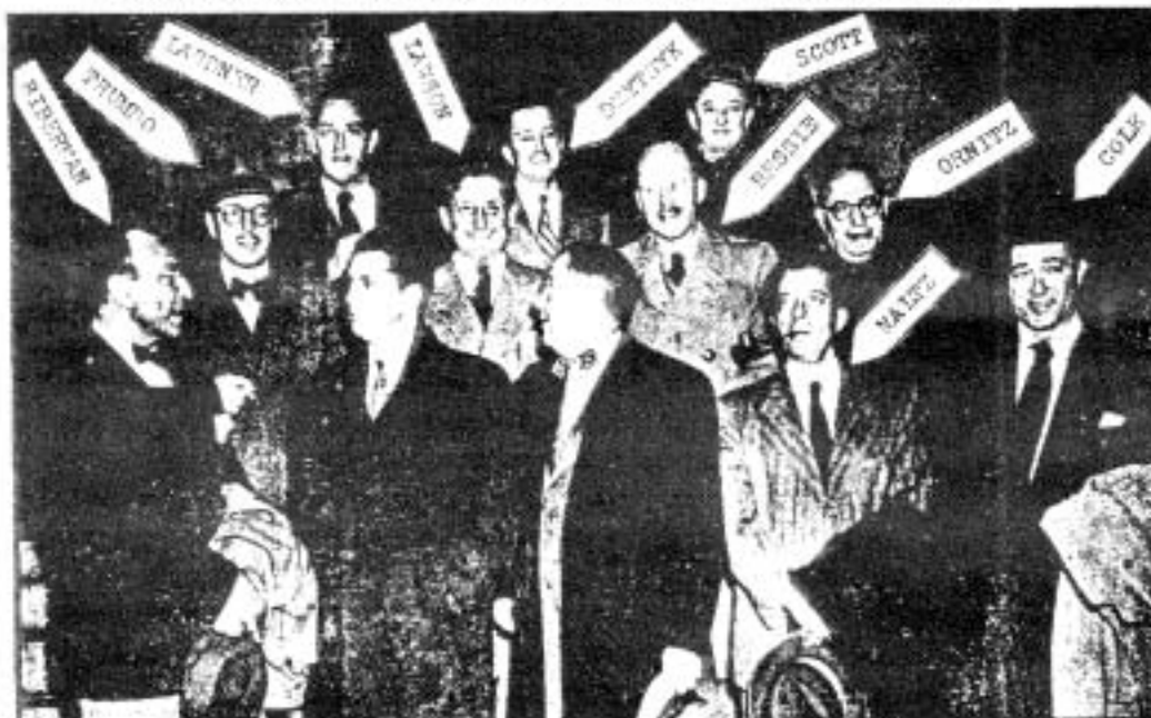
Shown above are the convicted "Hollywood Ten." All wear $200.00 suits, all are in the one-to-five thousand dollar a week income bracket. All of them are Yiddish except one.