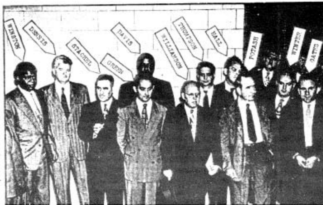
The "Convicted Eleven" were, next to Gerhart Eisler, the highest ranking communists ever convicted in the U.S. This "American Politburo" consisted of six Jews and five non-Jews.