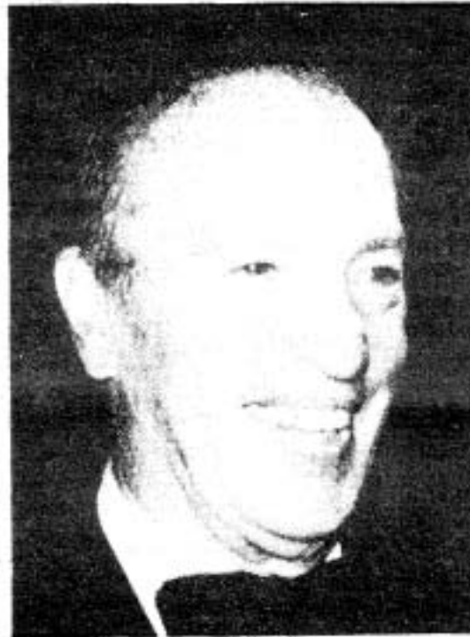
Media Boss Leonard Goldenson: Television

The control of the opinion-molding media is monolithic. All of the controlled media—television, radio, newspapers, magazines, books, motion pictures—speak with a single voice,