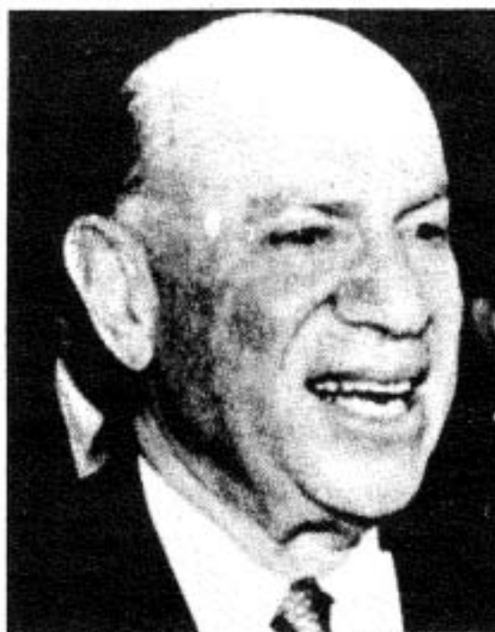
Media Boss Laurence Tisch: Television

CBS was under the domination of William S. Paley for more than half a century. The son of immigrant Jews from Russia, Paley left the family cigar business in 1928, when he was 27, to buy United Independent Broadcasters for $500,000. He renamed it Columbia Broadcasting System and made himself president. He became chairman of the board in 1946 and held that post until his partial retirement in 1983.