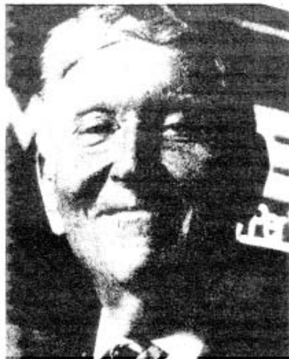
Media Boss Sumner Redstone: Television

In only 54 cities in America are there more than one daily newspaper, and competition is frequently nominal even among them, as between morning and afternoon editions under the same ownership. Examples of this are the Huntsville, Alabama, morning News and afternoon Times ; the Birmingham, Alabama, morning Post Herald and afternoon News ; the Mobile, Alabama, morning Register and afternoon Press ; the Springfield, Massachusetts, morning Union , afternoon News , and Sunday-only Republican ; the Syracuse, New York, morning Post-Standard and afternoon Herald-Journal —all owned