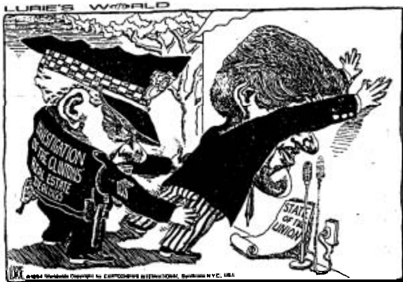
State of the President

Full Disclosure, Box 903, Libertyville, Illinois 60048