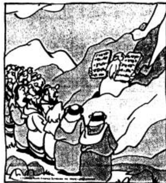
"It sounds too threatening. How about 'The Ten Recommendations'?"

A bleak picture? Magical cures? How about some miracles? Then why don't YOU start redrawing and creating a different picture? Why don't YOU present some magical cures—GOD will provide the substance, and, moreover—WHY DON'T YOU PRESENT THE MIRACLES (I DIDN'T SAY MAGICAL TRICKS)? IT IS YOUR RESPONSIBILITY—NOT MINE! SALU.