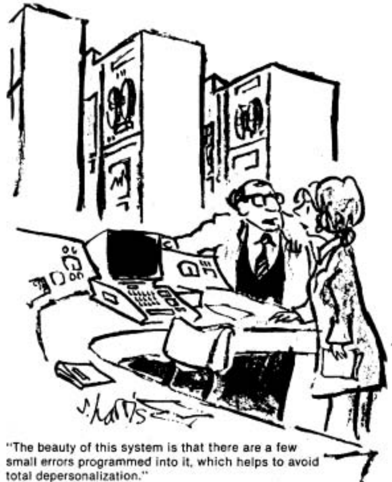
"The beauty of this system is that there are a few small errors programmed into it, which helps to avoid total depersonalization."

What is strikingly apparent from the testimony and depositions of key witnesses and many documents is that...[The Department] engaged in an outrageous, deceitful, fraudulent game of cat and mouse, demonstrating con-