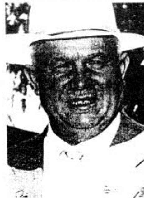
NIKITA KHRUSHCHEV ... Said an agreement had been reached with North Vietnam for using U.S. POWs for experimentation.

After the Korean War, those who were being used in experiments not yet completed or who were still sufficiently healthy to be of further