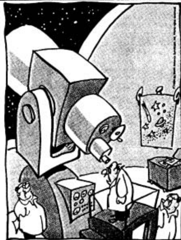
"Okay...who put the shoe polish on the eyepiece?"

FOR GENERAL BACKGROUND INFORMATION ABOUT PRIVACY, THE VALUE OF NEVADA CORPORATIONS, THE MASSIVE DECEPTION OF THE FEDERAL RESERVE AND ITS IRS EXTORTION RACKET, AND THE GENERAL TRUTH BEHIND OUR MODERN ECONOMIC MALAISE, SEE THE PHOENIX JOURNALS: (#4) SPIRAL TO ECONOMIC DISASTER, (#10) PRIVACY IN A FISHBOWL, (#16) YOU CAN SLAY THE DRAGON, AND (#17) THE NAKED PHOENIX. See Back Page for ordering information.