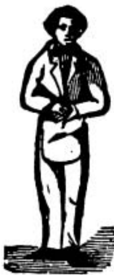
Due-Guard. Entered Apprentice.

Master inquires, "Why do you leave the west and travel to the east?"