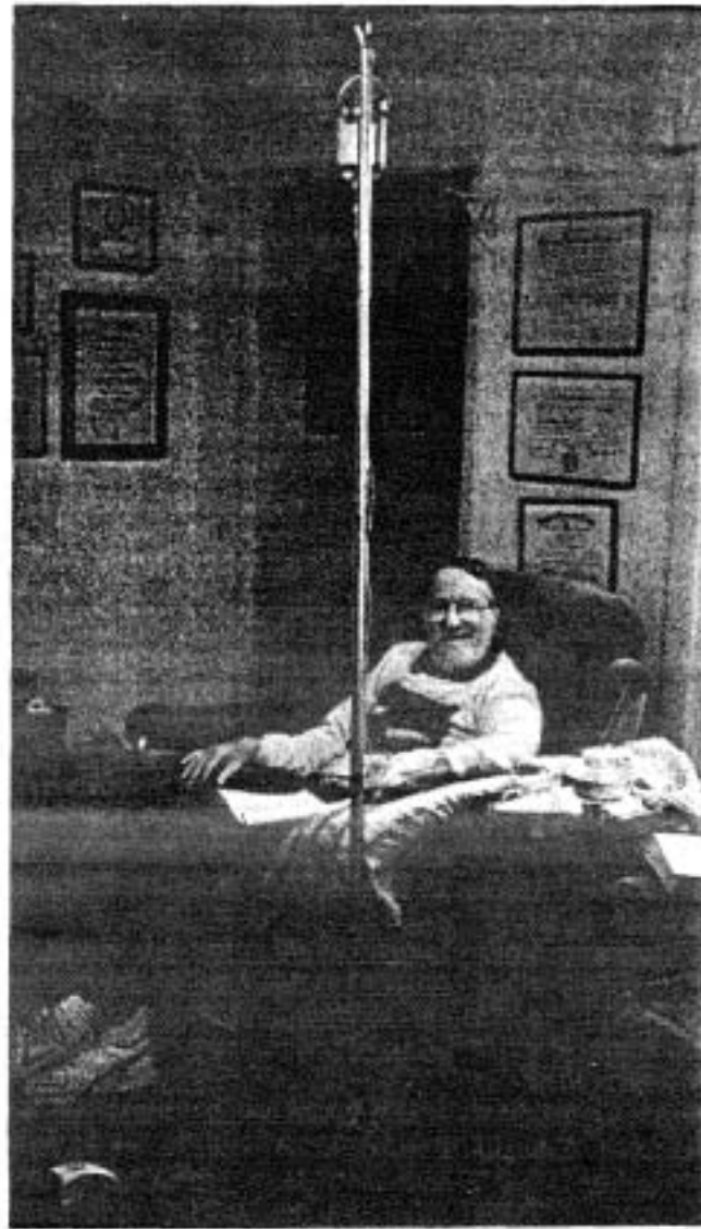
The chelation solution is administered intravenously, a painless procedure that takes 3 hours, during which patients usually read, chat with each other, or nap.

treatments. The federal government refuses to fund any studies to prove whether chelation works or doesn't work. In fact, we've approached the National Institutes of Health with the fact that over 500,000, probably closer to a million, citizens in this country have received chelation over the last four decades. If this is a fraud, it should be the government's duty to expose it, so why doesn't NIH just invest the money to prove that chelation is a fraud, or otherwise. If you believe chelation is a fraud, prove it! They won't even fund that. Then they'll turn around and fund $50 million or $100 million to prove that bypass surgery does something. And all the studies prove is that bypass does very little. Oh, it does a little. It relieves pain if a person with heart disease has angina so severe that it can't be controlled with calcium blockers and nitroglycerine. Pain is then what