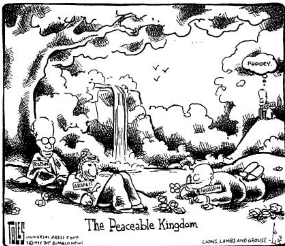
The Peaceable Kingdom

That period of "history" has got to take place before the final ditching of our old teacher, Satan. Perfection is GOD —we only need to go for a bit of harmony, peace, love and BALANCE and see if MAN has grown enough to hold to the LIGHT instead of sinking back into the total darkness of ignorance. BUT —the lamps have to be refueled and lighted and YOU are going to have to see to it.