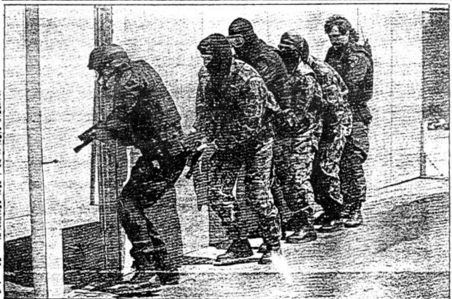
Russian police, in the Bay Area to learn crime-fighting techniques, wore camouflage outfits during a training exercise.