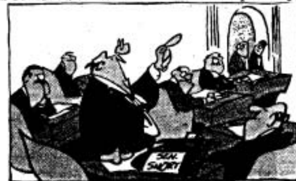
"We know the intelligence of the American voters! They elected us, didn't they?"

According to the Constitution for the United States of America , all powers not delegated to the federal government by the "We the People", is reserved to the States or the People respectively.