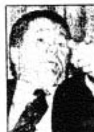
Zhirinovsky: Claims not to be anti- Semitic

He was invited to the United States to address the World Affairs Council of Northern California on Mon-