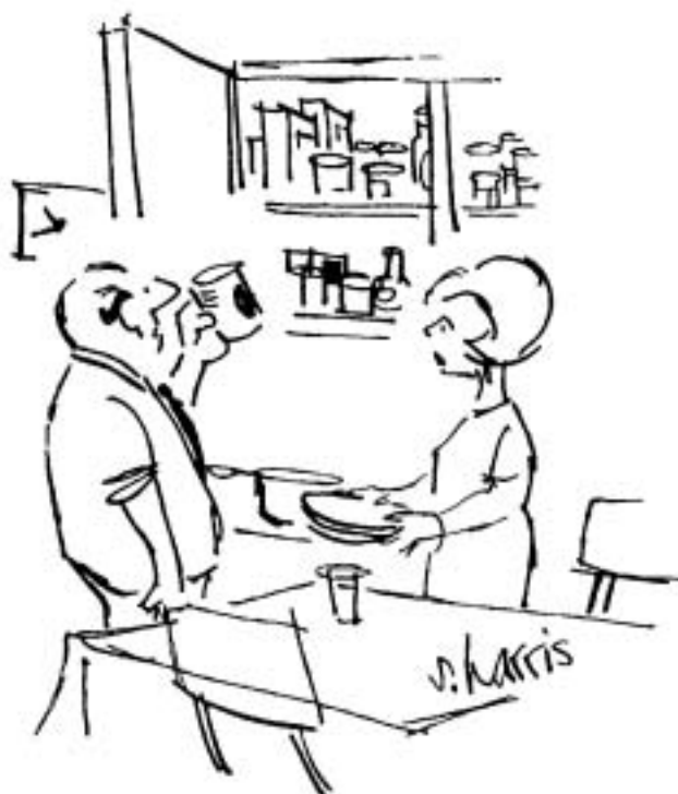
"Clam chowder—Ingredients: clams, potatoes, water, hydrolyzed plant protein, sodium phosphate, calcium carbonate, butylated hydroxytoluene. For external use only."

There would be even stronger reports except for the