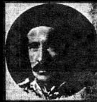
Gen. Charles 'Chinese' Gordon

Imagine an American general who celebrates as a hero, a British homosexual drunk, who helped kill 20 million Chinese, Charles 'Chinese' Gordon. This genocidal lunatic is put forward as the model Christian for Americans and the world to follow.