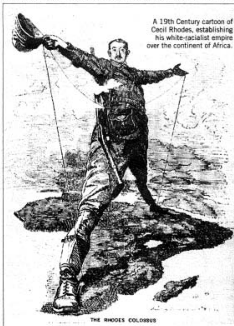
A 19th Century cartoon of Cecil Rhodes, establishing his white-racialist empire over the continent of Africa.

This was an experiment on American Blacks, to see what could be done in the new era of Jim