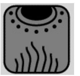
Year 21 Red Dragon, First of 20 Tzolkin Glyphs

The Sun rises in the East and appropriately, the first Mayan/Tzolkin glyph is the first of five "Suns of