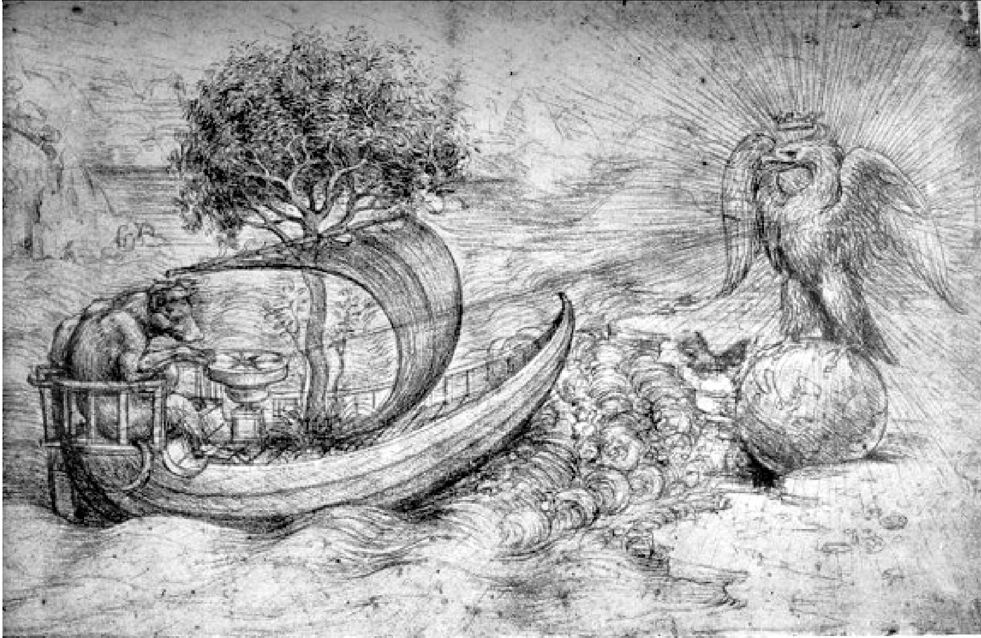
Five hundred year-old sketch by Leonardo da Vinci portrays the CONFRONTATION as full-out ego intent drives straight at the heart of the Phoenix and the Divine Plan.